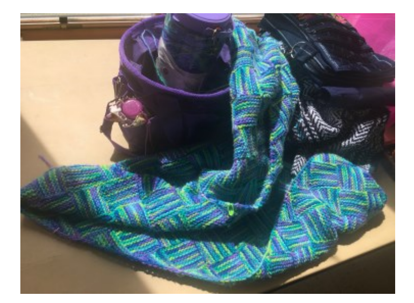
Entrelac knitting (For those who are as mesmerized by the pattern as I am, here is a link to a <u>short tutorial</u>)